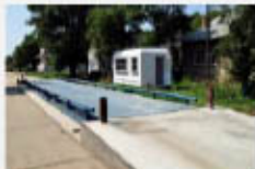
Pitless Type Installation